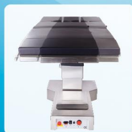
Table top sideways sliding 15cm provides a perfect position for X-ray radiography and surgery procedures.